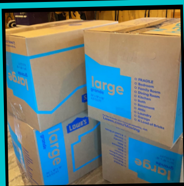
Heading our way!

Sneak Peak Next Issue: Halloween Costume Winners and Raffle winners announced and Christmas Shopping tips for our young riders.