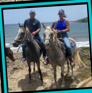
Diamond didn't get the memo.