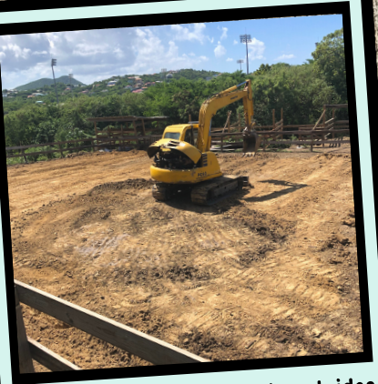
Sewak's excavator making strides in grading the arena.